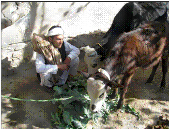
Cauliflower proceeds used to buy animal feed