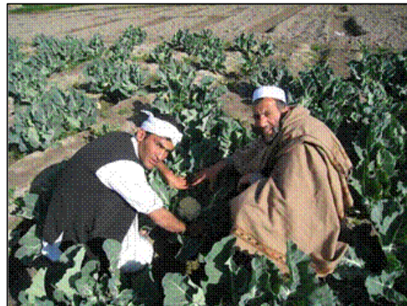
FSC employee provides assistance